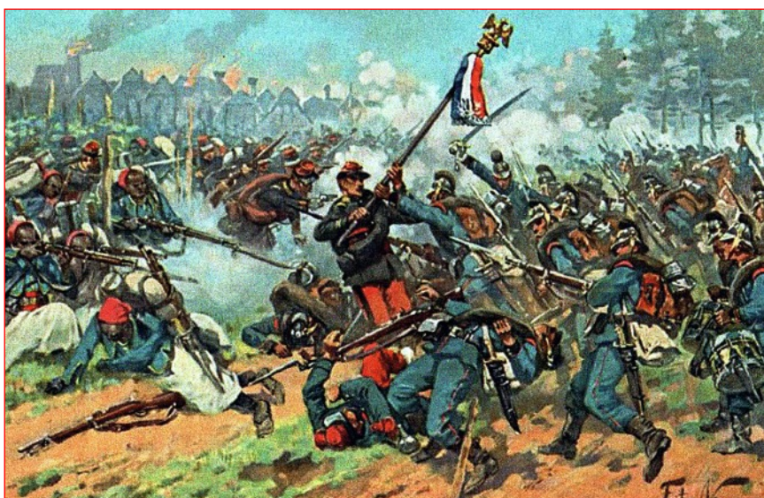
This colour illustration depicts the Bavarians seizing the Eagle of the French 36 th Line Regiment.

When the war broke out in July 1870, the Prussians were a little apprehensive of just how committed the Bavarians were to the cause. An