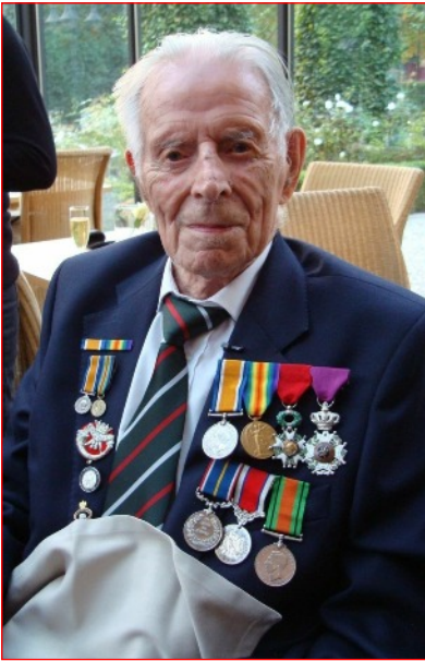
Harry in his later years.

H aving suffered the loss of D-Day veteran Harry Billinge, who died at the beginning of April, aged 96, and with Remembrance Sunday fast approaching, it seemed especially appropriate to feature this bust of Harry Patch in this issue. Members will remember that Lance Corporal Harry Patch, who died on 25 th July 2009, aged an incredible 111 years, 1 month, 1 week and 1 day, was the last surviving soldier to have fought in the trenches of the First World War. Born in Combe Down, Somerset on 17 th June 1898, he was conscripted into the army, served in the Duke of Cornwall's Light Infantry in a Lewis Gun section, and, on 16 th August 1917, was seriously wounded by shrapnel from a shell that killed three of his closest friends, at the Battle of Passchendaele – the Third Battle of Ypres.