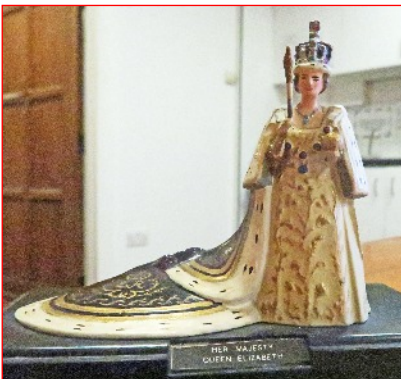
A figure of Her Majesty Queen Elizabeth II.