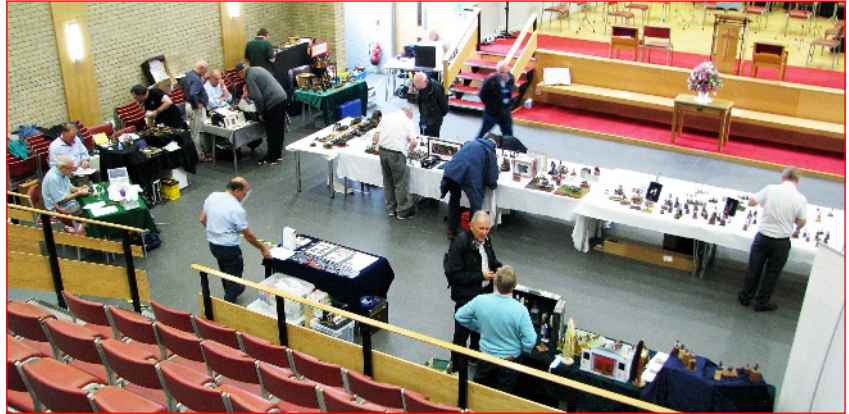
The competition tables begin to fill up in the main hall.

And what a day it proved to be! First, the new venue turned out to be a bright and airy building with a number of rooms and spacious corridors given over to the show, the largest of which, the main hall, was an ideal location for a number of club stands and traders, and also for all the