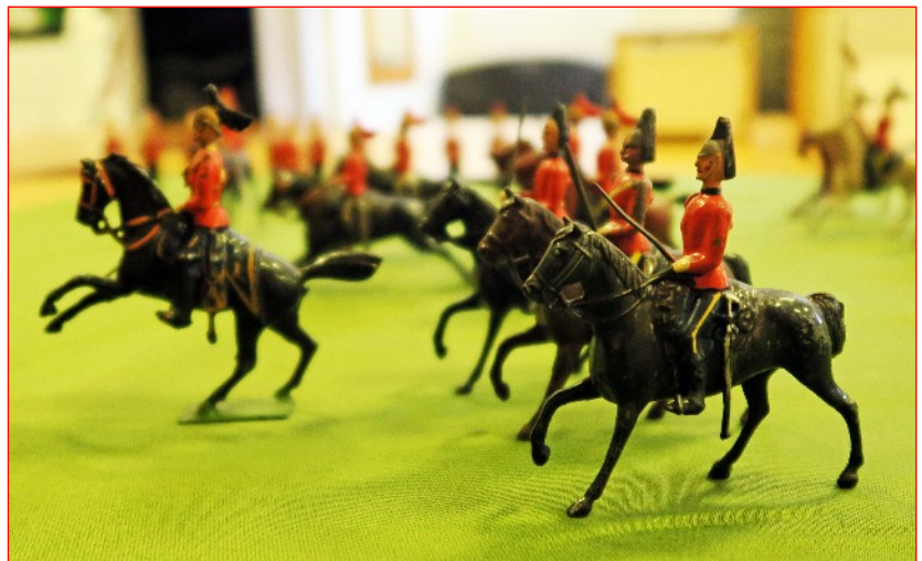
A close-up of some of the Dragoons.

August 2021 will be remembered in BMSS history as the return of the meetings at Pimlico, for the first time since March 2020 when they had to be suspended owing to the Covid pandemic. It was a cautious return to in-person meetings. All those attending wore face-coverings, except when performing the ancient ritual of tea-drinking and for posing for the photograph. The number attending was well down on pre-pandemic levels but, for the first returning meeting, this was to be expected. Many of our previous regular attenders were missed, perhaps indicating an understandable caution about travelling and meeting in-person, especially for those who are vulnerable to Covid and for whom being careful is vital. The meeting