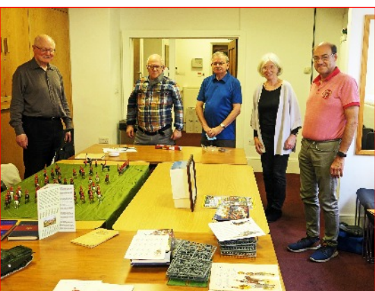
The valiant group re-starting the Pimlico meetings - briefly without their face coverings.