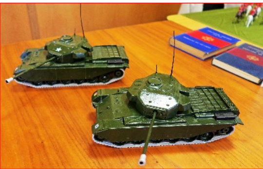
Centurion tanks

was also in August, the peak holiday month, and this may also have affected attendance.