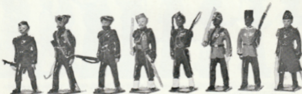
Left to right. 6th Gurkha Rifles (1). Coke's Rifles, 1857 (2). Gold Coast Haussas, 1897 (2). Queen Victoria's Own Madras Sappers and Miners, c. 1896 (2). Royal Canadian Artillery, 1896 (1).