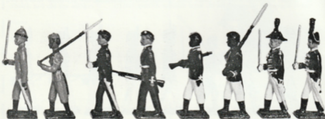
Left to right. Karen Military Police, Burma, 1899 (2). Christchurch City Guards, New Zealand, c. 1899 (2). Zululand Nongquai, c. 1892 (2). Ulster Hillsborough Castle Guard c. 1897 (2).