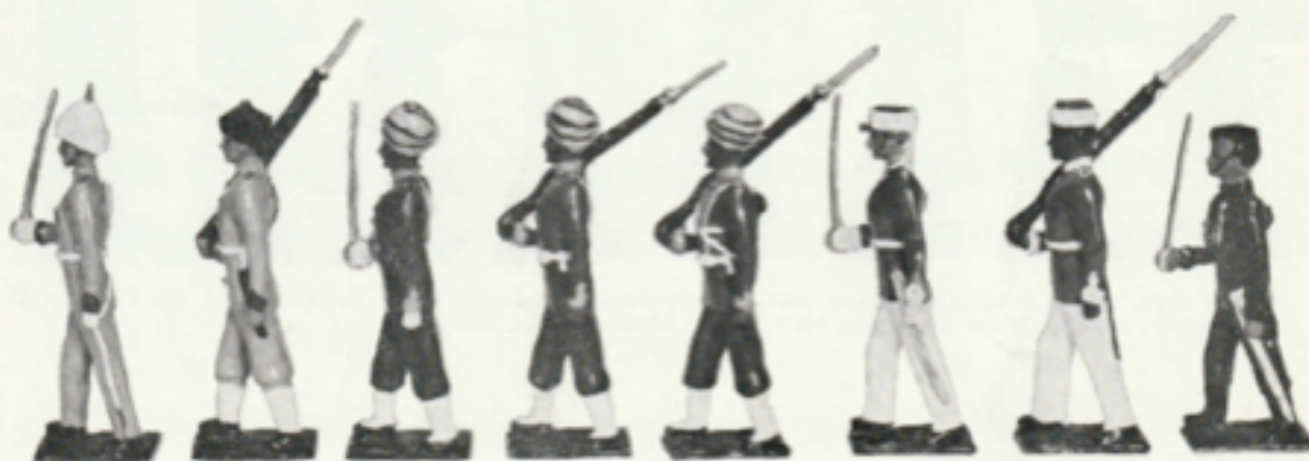
Left to right. Hong Kong Submarine Engineers, 1897 (2). 15th Ludhiana Sikhs (3). Jamaica Militia Volunteers, 1885 (2). 6th Gurkha Rifles (1).