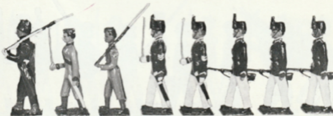
Left to right. Royal Canadian Artillery, 1896 (1). British North Borneo Military Police, 1897 (2). Singapore Rifle Volunteer Corps, 1899 (5).