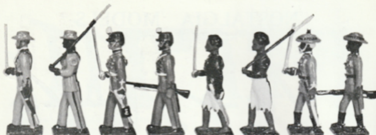
Left to right. Barbados Volunteer Force, 1902-1909 (2). Mount Alexander Rifles, Australia, 1875 (2). Fiji Armed Constabulary, 1900 (2). Maori Contingent, New Zealand Mounted Rifles, 1897 (2).