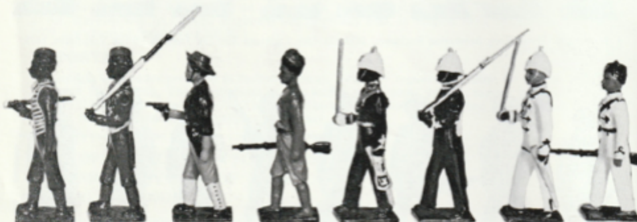
Left to right. Sierr Leone Royal Artillery, 1897 (2). Gaunt's Red Caps, Samoa, 1899 (2). Trinidad Field Artillery, 1897 (2). Sarawak Rangers, c. 1902 (2).