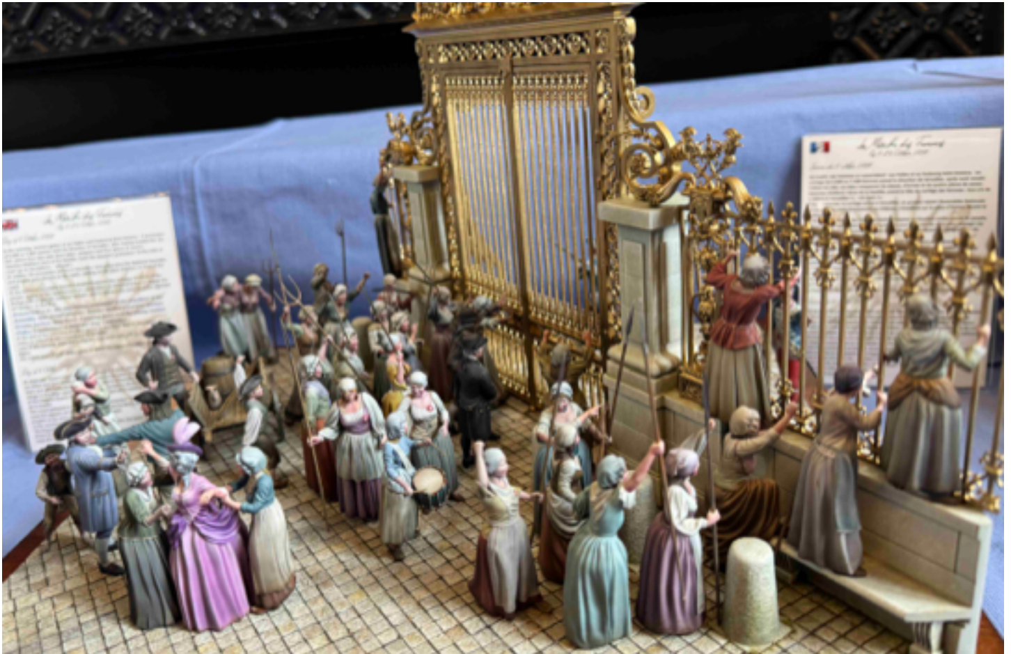
A photo of the Best in Show in the Historical Class at World Model Expo in Versailles.