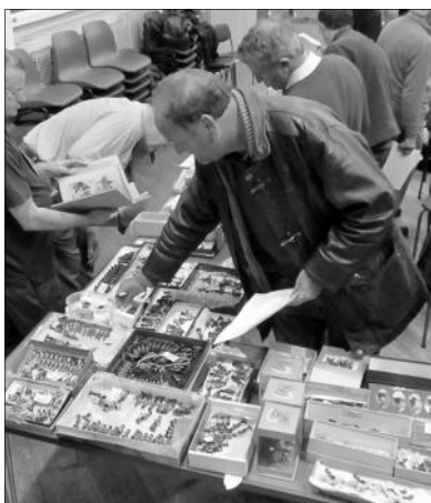
Members view the serried rows of lots prior to the auction

There was a bit of a pause in the action when half a dozen lots of single 90mm connoisseur models failed to attract a bid. There are always going to be unsold items in a sale consisting of two hundred lots, and things soon picked up again. Three Britains boxed knights of Agincourt were a good buy at just over £60 each. Britains repainted Guards and other figures were averaging between £2 and £3 per figure, while similar guardsmen and highlanders, in original paint, did no better. A Britains set 2037 R.A.F marching made just £70 and, among the repaints, was a Britains Army Staff Car - this also made £70. Other Britains lots included an incomplete Band of the Coldstream Guards which made £65 and a set of five 16 th Lancers that went for the same price. Four 21st Lancers on pony horses made £85 - somebody did well there - but £30 for a window box set of 16 th Lancers just reflects the current market for post-war Britains . There were a few lots of civilians in the sale and 13 Coco Cubs reached the £100 mark and an 8-figure seated Jazz