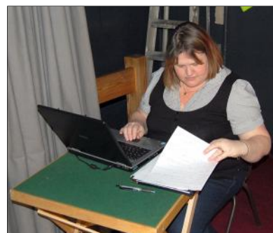
Truly dedicated - the Hon Secretary, while attending the Welling Model Club Annual Show in her capacity as co-proprietor of "Name It", was spotted, tucked away in a quiet corner, typing up these minutes!