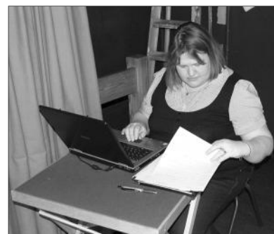
Truly dedicated - the Hon Secretary, while attending the Welling Model Club Annual Show in her capacity as co-proprietor of "Name It", was spotted, tucked away in a quiet corner, typing up these minutes!