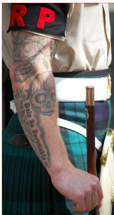
This Regimental Policeman's tattoo appropriately reads: "Pain Is Inevitable"!

O n Tuesday, 25 th June 2013, the Argyll and Sutherland Highlanders, 5 th Battalion the Royal Regiment of Scotland, having received the Freedom of the City of Canterbury in 2008, exercised their right to march through the City for one last time, with drums beating, Colours flying and bayonets fixed. At the conclusion of the march, the Regiment attended a special service in Canterbury Cathedral.