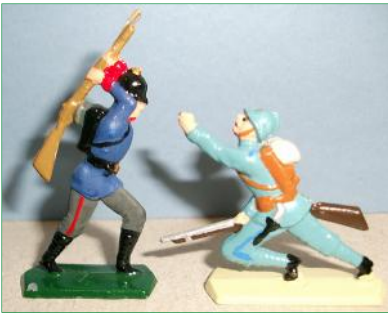
These French and German World War I demi-ronde figures are by Gebruder Schnieder

believe, was a member of the BMSS in the 1940s and 1950s), I was shown how he cast up figures using a mould that produced demi-ronde figures.