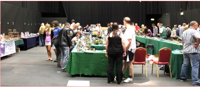
A general view of the Show