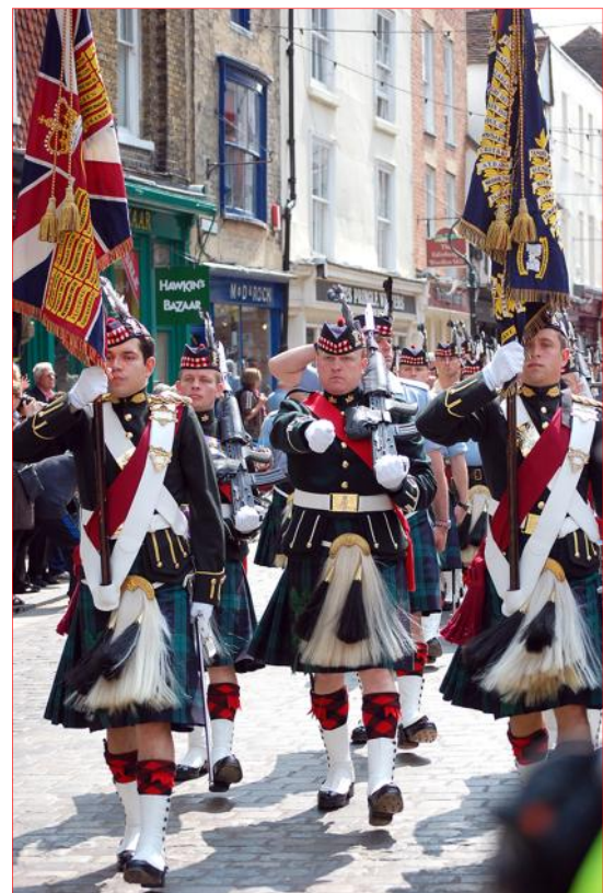
The Colours are proudly carried down Burgate Street