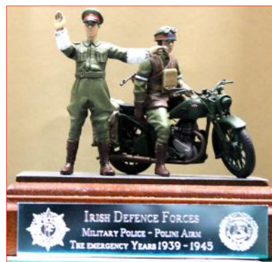
Military Police of the Irish Defence Force 1939-1945

As you can see from the pictures accompanying this piece, there was plenty to see and interest the modeller for the whole weekend. Looking forward to next year!