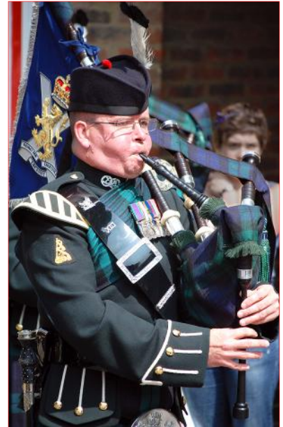
The Pipes & Drums play the Regiment into the Cathedral