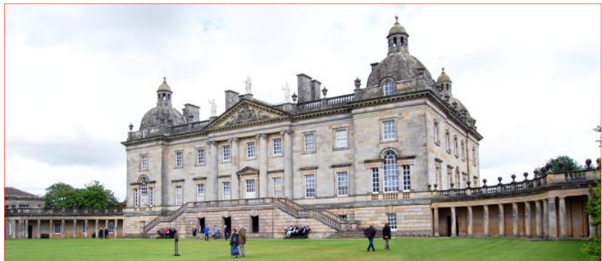
Houghton Hall was actually designed to house Sir Charles Walpole's magnificent collection of Old Master paintings

The figures are in a variety of scales, mostly painted to a very good standard and also include some French flat tin soldiers from Paris which have considerable charm (but are not particularly well painted) and a small number of large (roughly 18 inches to two feet high) wooden figures, clothed in fabric and