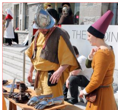
The Galloglass re-enactor