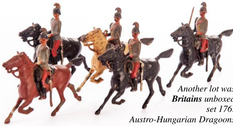
Another lot was Britains unboxed set 176: Austro-Hungarian Dragoons