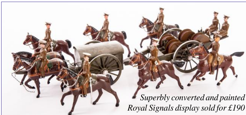
Superbly converted and painted Royal Signals display sold for £190

what I thought was a low estimate, to get to £220. Prices reflected a slide in popularity for South American