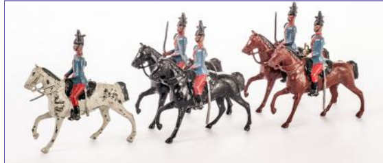
(Right) Britains unboxed set 175: Austro-Hungarian Lancers, 1902 horses