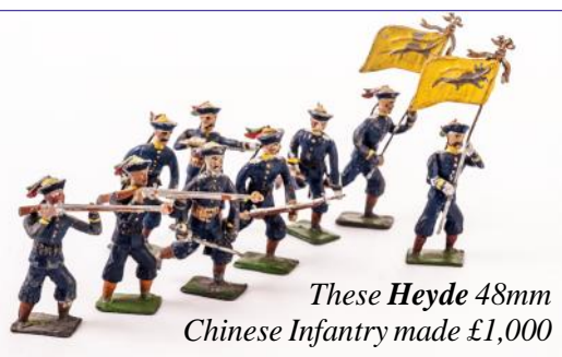
These Heyde 48mm Chinese Infantry made £1,000

If you are still building a collection, this is a good type of sale, useful for filling gaps and getting a few add-ons. Because very few items were in perfect condition, it did present the opportunity to buy something at a reasonable price. But it was rather annoying to find myself always bidding against fellow BMSS members and having to pay 18% on top of the purchase price. Though better than the 30% at Bonhams , it still puts a brake on one's bidding. With Britains , it is the early figures that hold the most interest for me. They may be less accurate but reflect