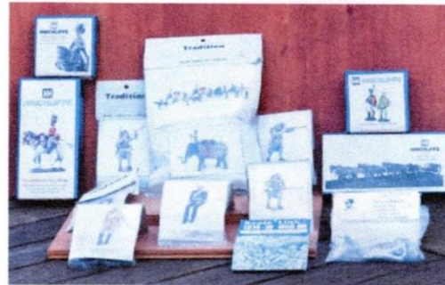
(above) 1425. A small selection of the assorted kits (NB: box labels are sometimes generic and don't necessarily match contents).