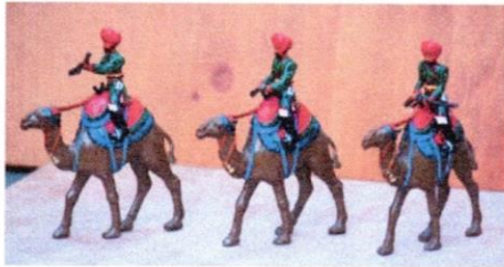
(above) 1413. Nostalgia Camel Gunners, 3 rd Nizam's Cavalry, 1848.