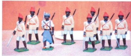
(above) 1419. Nostalgia Kossou Swordsmen, Ashanti War, 1874.