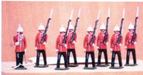
(above) 1429. Nostalgia Western Australia Infantry, Diamond Jubilee, 1897.